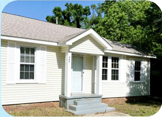
907 N 57 th Ave & 909 N 57 th Ave